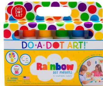
Example of Dot Paint